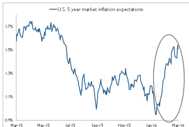
Fig 2: &w signs of recession